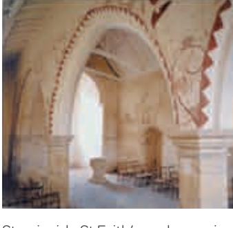
Little Witchingham, St Faith