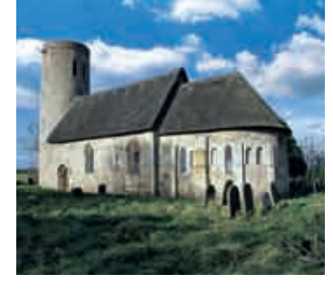
Hales, St Margaret

Almost perfect Norman church lost in time