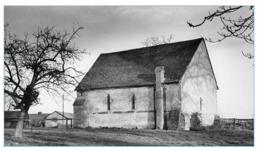
Exterior from the north-west (Christopher Dalton)

The church is 16 feet (4.9 metres) wide and 32 feet (9.7 metres) long, which is about two feet (0.6 metres) shorter than the original structure, the east wall having been rebuilt in the early 18th century within the bounds of the old church. In the north wall are two original windows and part of an easternmost one which was destroyed when the east wall was rebuilt in brick in 1729. There are also signs of a fourth window at the west end, but this is only visible internally. These original window openings are formed of single narrow lights about 15 inches (38.1 cm) wide and three feet (0.9 metres) tall. Externally they have a simple roll moulding and the top of each arch is almost rounded – a typically late Norman form for this part of England. Internally the windows are deeply splayed to allow the maximum amount of light to penetrate the thick walls and the tops of their internal arches are almost pointed – anticipating the Early English style of architecture which St John's church barely predates.