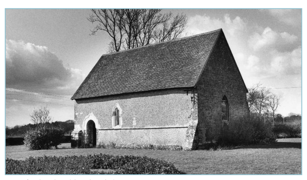
Exterior from the south-east (Christopher Dalton)

The most unusual aspect of this tiny church is the rare set of consecration crosses that survive. When mediaeval churches were first consecrated 24 of these crosses would have been anointed by the bishop using holy oil. In some churches the places to be touched were marked by painted crosses (for instance at the Trust church of Preston Candover), whilst more rarely, incised stone crosses would be used.