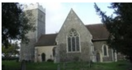
St Peters, Claydon